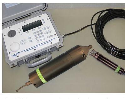
The VHTx transponding hydrophone pictured with the HR2 and VR100.

passing fish or equipment. The VHTx operates at 180 kHz frequency. The hydrophone is protected by a cage and is weighted to aid in lowering the hydrophone into water.