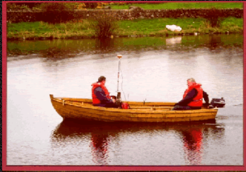
HydroLite in use at Kilmarnoch Reservoir.

The current trends in hydrographic surveying are toward larger, faster and dedicated data collection systems using state of the art GPS in conjunction with swathe echo sounders. This trend raises the standards and coverage for large scale surveys but the costs involved prohibit its use in small scale, low budget applications. The HydroLite system has been designed to provide a solution to meet the needs of inshore and shallow water hydrographic surveys utilizing readily available equipment. The HydroLite concept is particularly well suited to surveyors whose main activity is a mixture of topographic and small scale hydrographic work, including canals, lakes, reservoirs and inshore coastal surveying. The design philosophy used has been to provide a very small boat system that can be easily mobilized using a small craft of opportunity, an important feature being connectivity to a variety of positioning systems ranging from GPS/Robotic Total Stations to simple fix event marking. The central component within the HydroLite system is the SonarMite, a small, portable, single beam digital echo sounder which combines the functions of echo sounder and data logger.